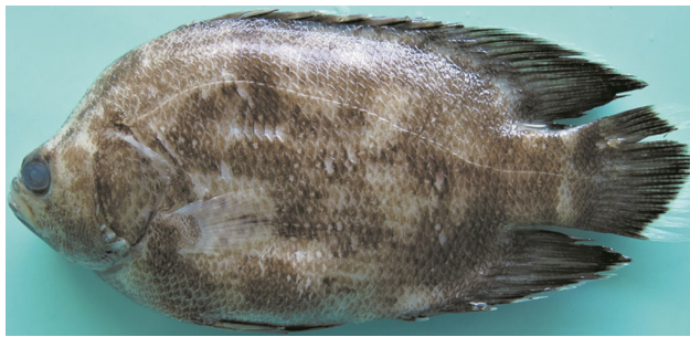
Fig. 2 — Formalin preserved specimen of L. surinamensis (TNJFU-MF-07), 97.2 mm SL collected from Pulicat lagoon