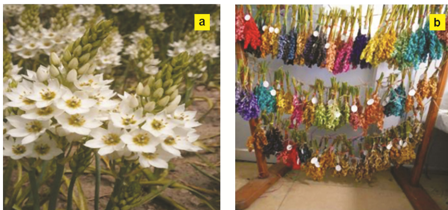
Plate 1 — a) Natural Chincherinchee flowers, b) Vertical hang drying of dyed chincherinchee flowers

calendars, floral belts, festive decoration and other creative displays 4,5 .