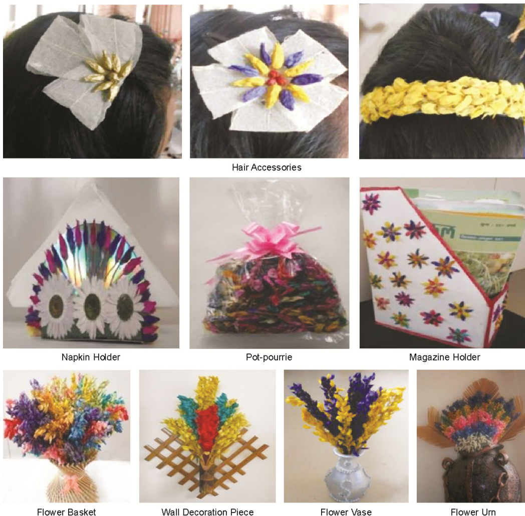
Plate 3 — a) Value-added products prepared from Chinchinchee

shows poor light fastness properties and the samples are substantially faded within 3-4 h of exposure time in MBTF light fastness tester 15 . Thus we can say that suitability of mordants varied from dye to dye. Wash and Light fastness of many natural dyes, particularly which are extracted from flower parts are found to be poor to medium as compared to synthetic dyes 16 . Poor light fastness of some of the natural dyes is attributable to photooxidation of the chromophore. Natural dyes can be used on most types of material or fibre but the level of success in terms of fastness and clarity of colour varies considerably 17 . Further corroboration comes from investigations of Kashyap et al 8 . where bio-colours exhibited very poor colour intensity and colour absorption except for colouring with turmeric and lilium pollen in Lagarus ovatus .