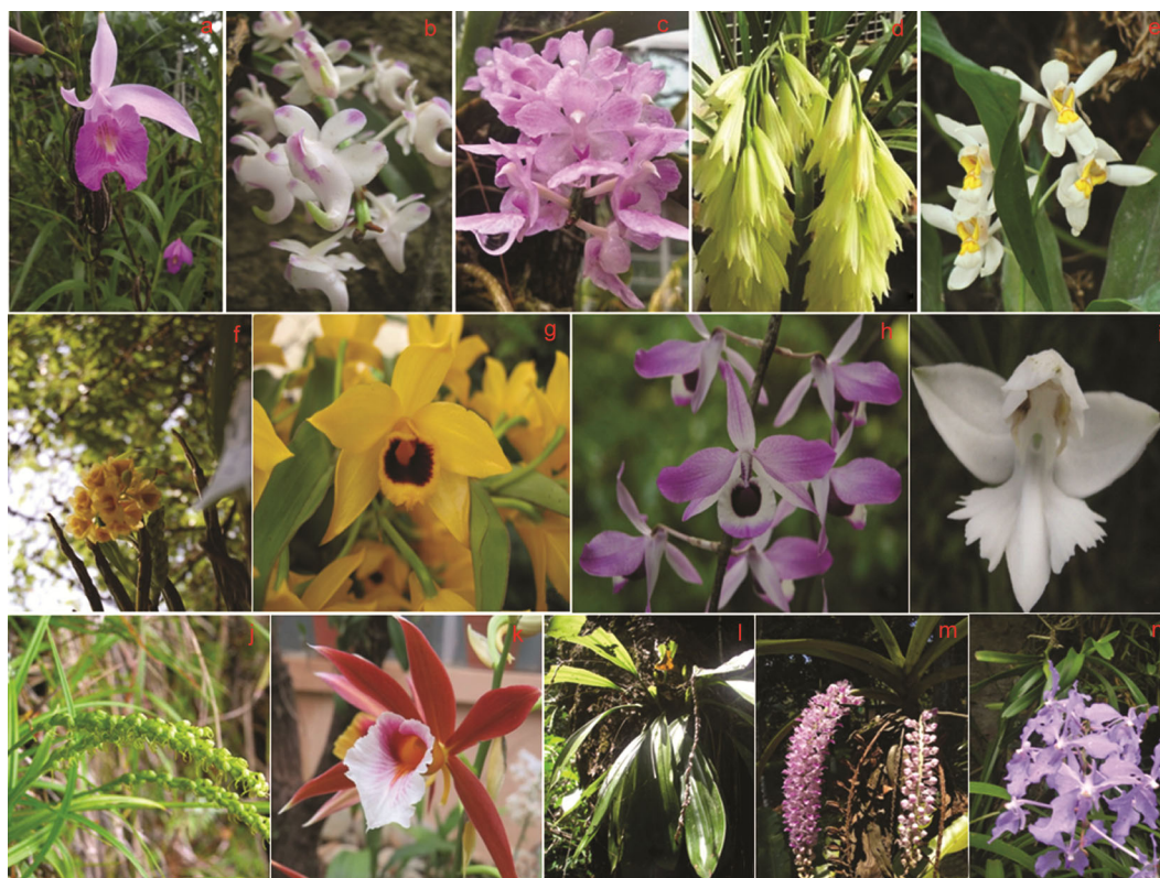
Fig. 1 — Orchids used in traditional system of medicine in Indian Himalaya. a) Arundina graminifolia (D. Don.) Hochr., b) Aerides odorata Lour., c) Aerides multiflora Roxb., d) Cymbidium elegans Lindl., e) Coelogyne punctulata Lindl., f) Dendrobium densiflorum Wall., g) Dendrobium fimbriatum Hook., h) Dendrobium nobile Lindl., i) Habenaria dentata (Sw.) Schltr., j) Herminium lanceum (Thunb. ex Sw.) Vuijk, k) Phaius tankervilleae (Banks) Blume, l) Pholidota imbricata Lindl., m) Rhynchosstylis retusa (L.) Blume, n) Vanda coerulea Griff. ex Lindl.

To find out the relative importance of various ethnomedicinal orchid species effective in the treatment of various human-associated problems, a quantitative index frequency (%) was employed. The results of the study are presented in Table 3 which indicates that the frequency ranges from 5.63 to 52.11%. On the basis of frequency, the most important orchid species investigated includes L. nervosa (Fq=52.11%), C. aloifolium (Fq=50.70%), D. nobile (Fq=47.89%), P. muscicola (Fq=46.48%), A. odorata (Fq=45.07%), H. dentata (Fq=40.85%), D. densiflorum (Fq=39.44%), R. retusa (Fq=26.76%), and A. setaceus (Fq=26.76%). The least medicinal orchids investigated were A. graminifolia (Fq=5.63%) and Herminium lanceum (Fq=9.86%) (Table 3).