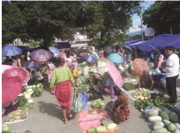
Fig. 2 — Local vegetable market at Pasighat, East Siang

Further, to document historical account by capturing the sequence of remembered historical