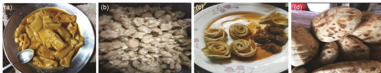
Fig. 9 — Wheat based products (a) Chu-tag i (b) Paqtsa-markhu (c) Timoq (d) Tagi-skyurchuk .

Paqtsa markhu: Wheat dumplings are cooked in water and strained. These are then mixed with butter, cheese powder, and sugar. The dumplings here are flat round or spherical shaped and small in size