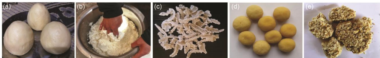
Fig. 7 — Dairy products (a) Mar-khaqla (Butter) (b) Labo (Cottage cheese) (c) Churpe/chura (d) Chura-narmo (e) Thut .