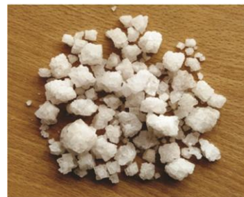
Fig. 4 — Tsa (salt).

Salt or tsa (Fig. 4) was one of the prominent candidates of the barter system and had been procured from Tibet before Chinese occupation. Tibet is the land of brackish water lakes from where salt is extracted. The locals used to load the salt in bags made up of yak-wool, nugal , on sheep, goats, yaks, etc., and exchange with other essential commodities