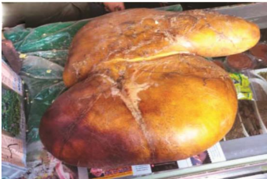
Fig. 2 — Butter preserved in animal stomach.

The Indus river and most of the streams in Ladakh are good sources of a variety of fresh and cold-water