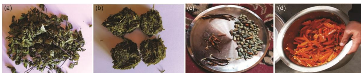
Fig. 3 — Vegetables based products (a) Dried Zatsot (b) Skokir (c) Toma and gege (d) Carrot pickle.