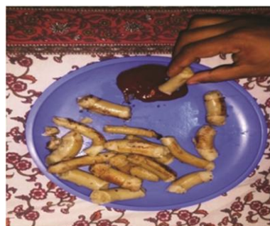
Fig. 5 — Gyuma (sausage).

in other parts of Ladakh. Good quality of salt is also extracted from the famous Tsokar Lake in Changthang. The higher quality salt is used for human consumption and that of lower quality is used for animal feeding.