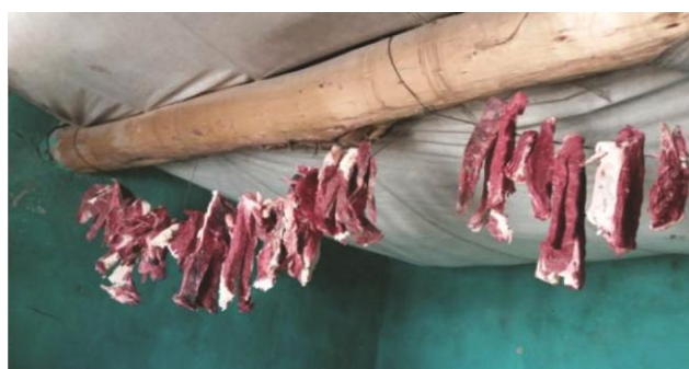
Fig. 1 — Traditional method of meat.

Changthang is the livestock belt of Leh district of Ladakh. The locals consume a lot of milk and milk products along with meat and these foods fulfill their