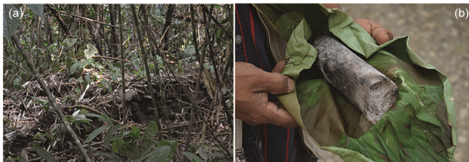
Fig. 2 — Photographs of traditional salt producing methods (a) Remnant of dry abandoned ancient Salt producing furnace at Borduwaria; (b) Traditionally made salt tube at Khela Village

The physical parameters measured from the studied samples include appearance, colour and odour. Temperature could not be measured at site as the local villagers do not permit to bring any items near to the well. All the collected samples under study are clear, colourless and odourless (Table 2). The chemical parameter of the salt sample infers pH values from 7.5 to 8.9. Except the sample of Semkhor rest two samples shows the higher concentration of chemical parameters such as higher electrical conductivity ( EC > 1000 \mu\text{s/cm} ), total dissolve solid ( TDS > 640 ), salinity ( > 728 ) etc. (Table 2). The calculated chemical indices like BEX, \text{Na}^+/\text{Cl}^- , \text{K}^+/\text{Cl}^- , \text{Mg}^{2+}/\text{Ca}^{2+} , \text{Ca}^{2+}/\text{Mg}^{2+} , SAR values ranges from -20.58 to -203.74, 0.47 to 0.54, 0.001 to 0.006, 0.57 to 1.17, 0.86 to 1.76 and 14.70 to 53.53 respectively.