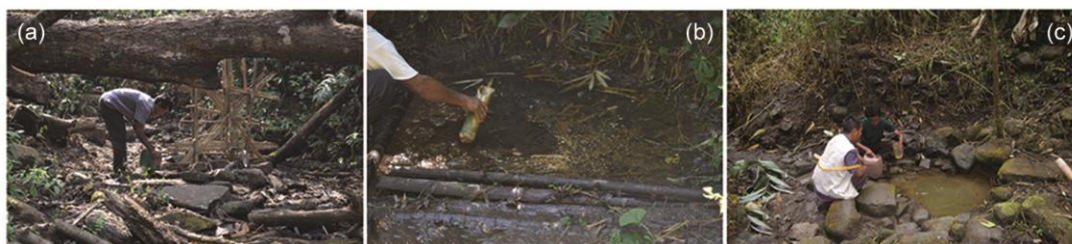
Fig. 3 — Photographs of salt spring during sample collection. Local people collecting samples at (a) Semkhor village, (b) Phullung village and (c) Khela village